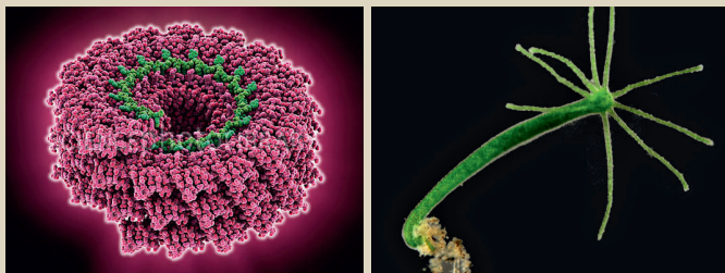
In the eye of research: Based on the tobacco mosaic virus (left), in the 1950s, Alfred Gierer proved that the virus's ability to infect plants originates in the nucleic acid. Gierer later focused on biological structure formation and worked on freshwater polyps (right).

The actual existence of viruses unfolds within animal, plant or bacterial cells. When viruses infect cells, they reprogram them so that they produce the virus nucleic acid, the virus shell and the other virus proteins. When sufficient components have been pro-